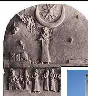
Ancient symbol of Ba’al worship and the modern symbol of allah worship. The same.

Bel, or Ba’al, the cult of the crescent-moon is finally destroyed. Bel has always been symbolized by the crescent-moon, which is also an image, emblem and symbol of the end-time beast. The ancient enemies of Israel worshipped a god that was symbolized by the image of the crescent moon. To this day this has not changed. The crescent moon is the symbol of islam today. All evidence points to the fact that allah is simply another name for Bel or Baal, which simply means lord and is also a title of reverence to the Babylonian moon-god.